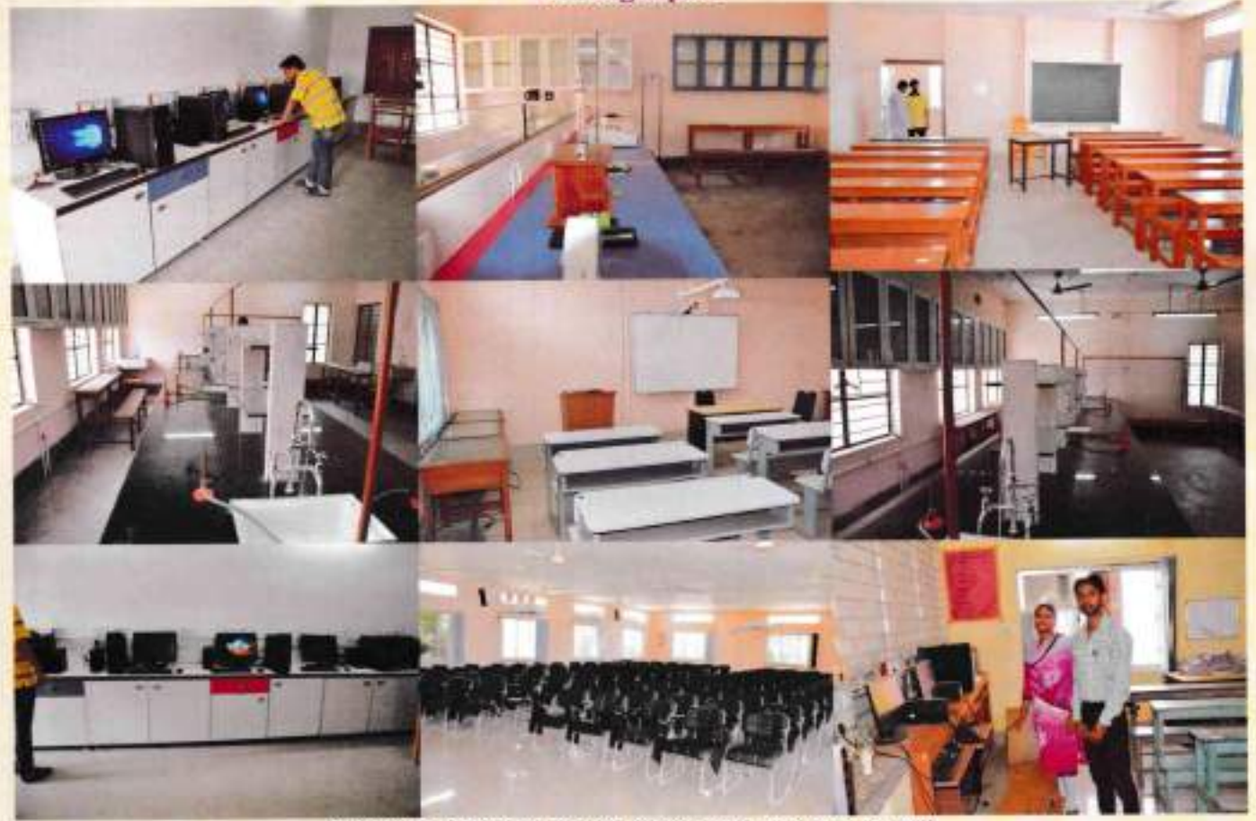
Science Laboratories Room & Vivekananda Seminar Hall