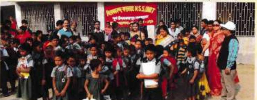
Simulia Village adopted by NSS Distribution Study Materials among the Poor Primary Schools Students

the college and active work by the Programme Officer and NSS volunteer of our college, two kinds of activities were organized at our college [which adopted village Simulia] i.e Regular activity and Special activity. Some Regular activities are Environment related—Conservation of Natural Resources, Preservation of Old Monuments, Historical and Cultural Heritage, Health related—Personal Hygiene, Public Sanitation, Awareness in the Legal Education, small project like Socio-Economic Surveys, Disaster Management Club, Red Ribon Club, Action Groups, Food Club. Our NSS Unit arranged some events viz. tree plantation, blood donation camp, health check-up camp, meditation