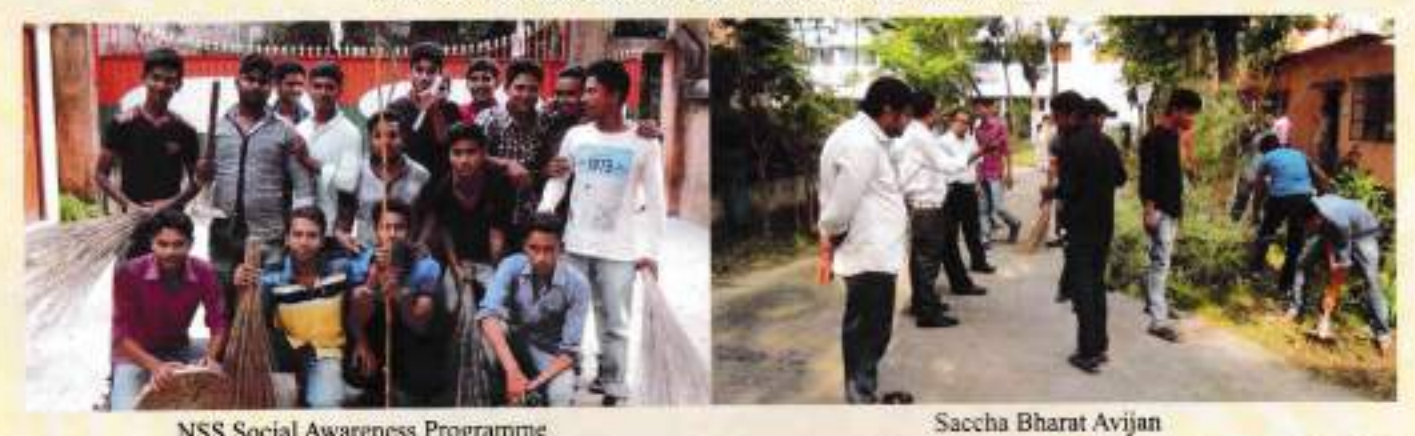
NSS Social Awareness Programme