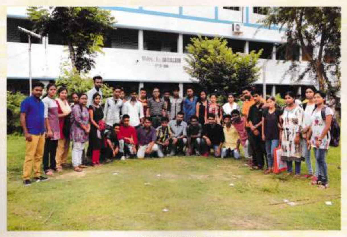
Students with Principal