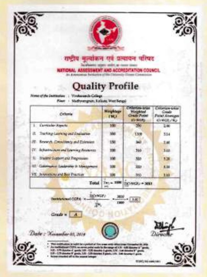
NAAC Accredited Certificate