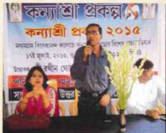
Seminar of Kannyasree Prakalpa