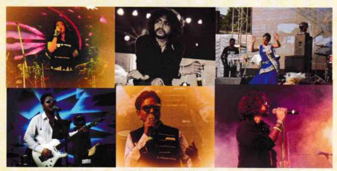
College Annual Social Function 2018