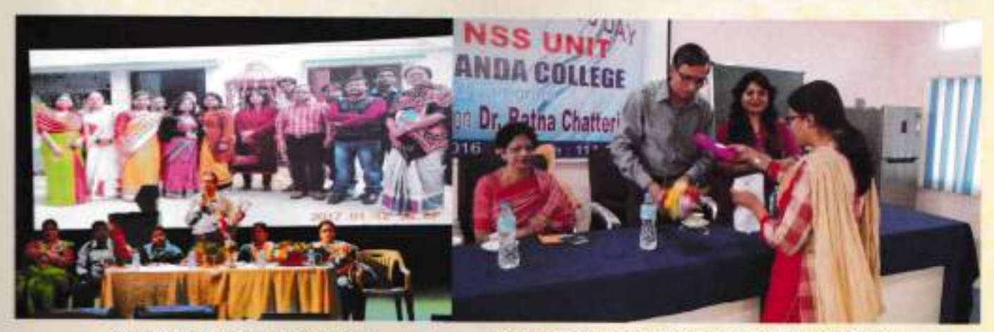
Observe Vivekanand's Birthday