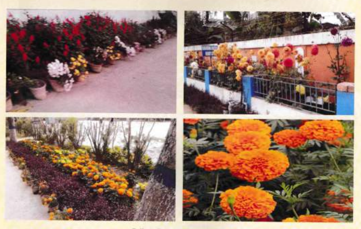
College Campus Flower Garden

The alumni association is doing its job very carefully. They always try to help the college in all respect. They help the poor students of the college frequently.