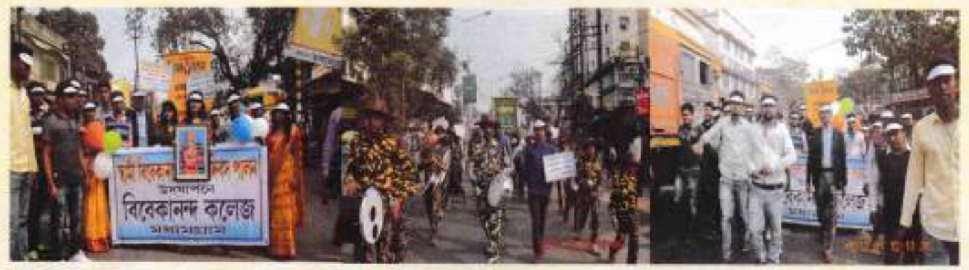
Rally on Vivekananda's Birthday (12 January, 2018)