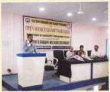
QGIS Work shop in presence of V.C.