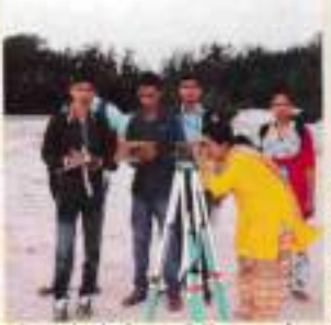
Practical class of Geography at Mondarmani