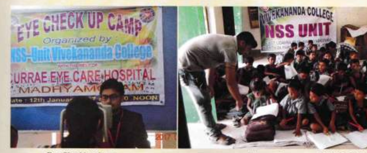
Eye Checking Camp