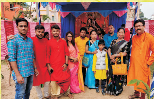
Celebration of Saraswati Puja in College premises

** In case of Computer Science, admission charge is fixed Rs.3,500/-per Semester including all charges.