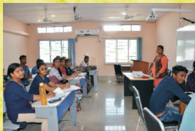
M.Sc. Geography Class Room