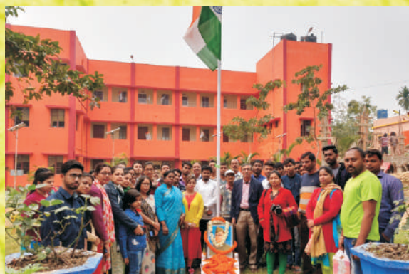
The Celebration of 122nd Birthday ceremony of Netaji Subhas Chandra Bose at Vivekananda College campus