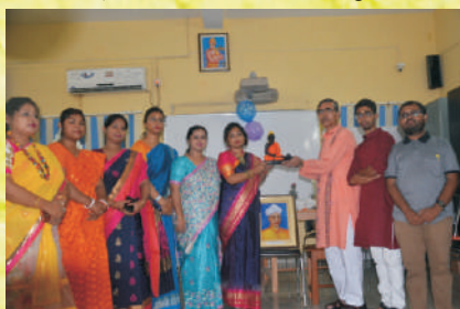
Teachers' Day Celebration by P.G. students of Geography