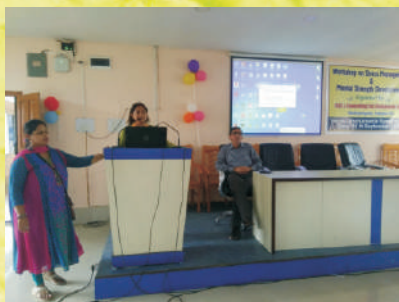
Career Counselling Session for 2019 organised by Techno India University and IQAC, Vivekananda College

administrative performance, well-e q u i p p e d infrastructure and support system pursuit. The Executive Committee of NAAC met on and awarded the college with 'A' Grade with GSPA of (3.01) on seven point scale on 5th November 2016 which is valid up to 4th November 2021. At present the college is preparing for the second cycle of NAAC visit.