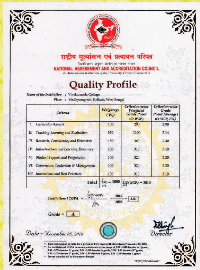
NAAC Accredited Certificate