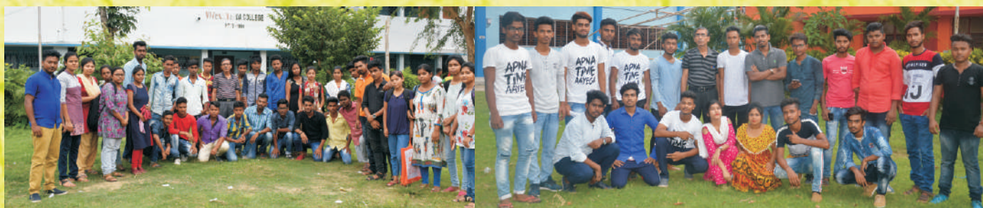
Students with the Principal

The College has a modern virtual classroom for the students in the premises. The teachers deliver their lectures through the utilization of this virtual classroom.