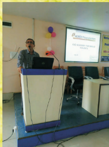
Job-oriented workshop of ICICI FOUNDATION