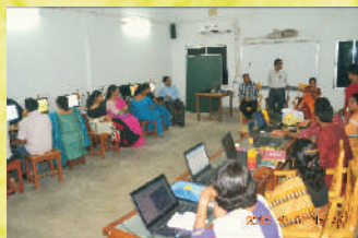
QGIS Training Programme