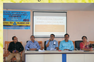
Debate Competition on the topic of INTEGRITY, A WAY OF LIFE