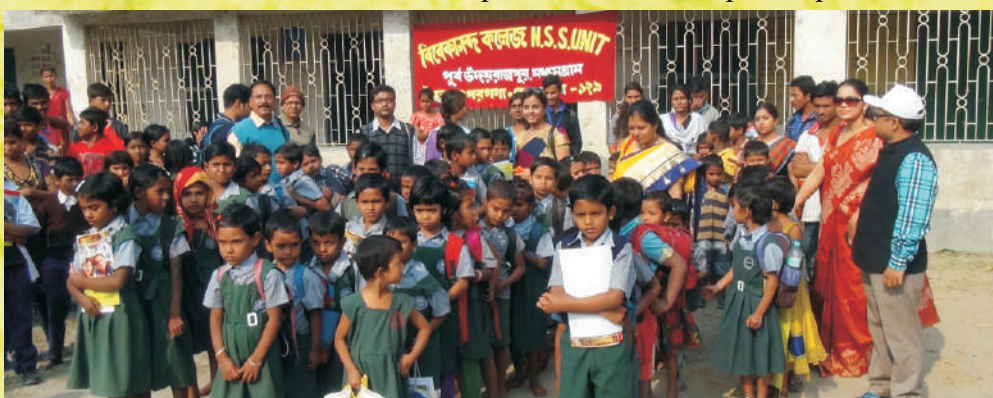
Simulia village adopted by NSS, distribution of Study Materials among the poor primary schools students

camp, distribution of exercise book, pencil, eraser, sharpener etc among the poor students of the Simulia pre-primary school, hand wash programme, health checkup camp, road safety awareness programme etc.