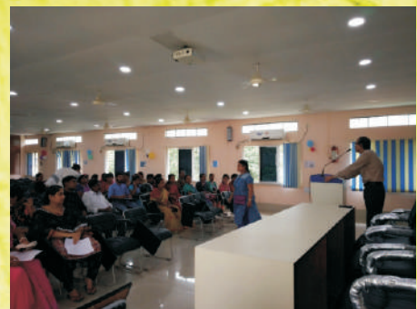
Sharodiya Utsav 2019 celebrated in College-Auditorium