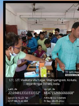
(Community Health checkup camp)