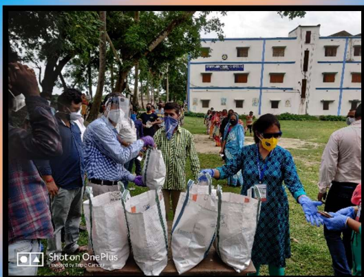
(Relief Distribution in the time of Covid-19 pandemic)