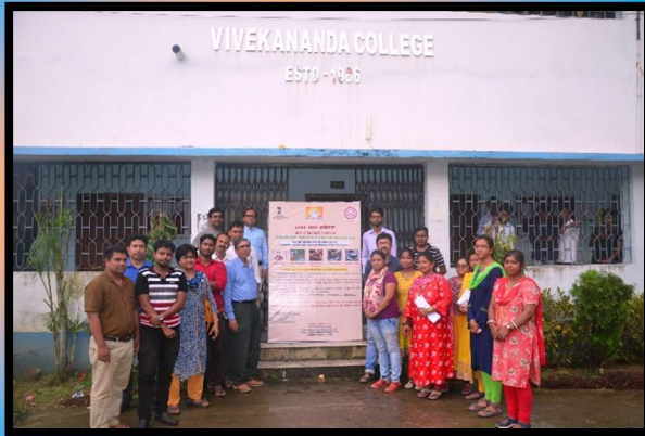
(College "Unnat Bharat Abhiyan" Team)