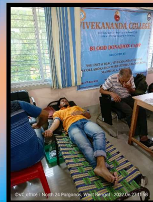
(Blood Donation Camp)