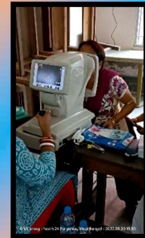
(Community eye checkup camp)