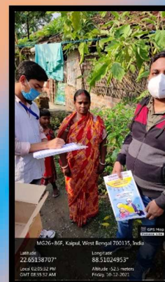
(Village survey under UBA)