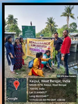
(Tree Plantation at Kaipul)