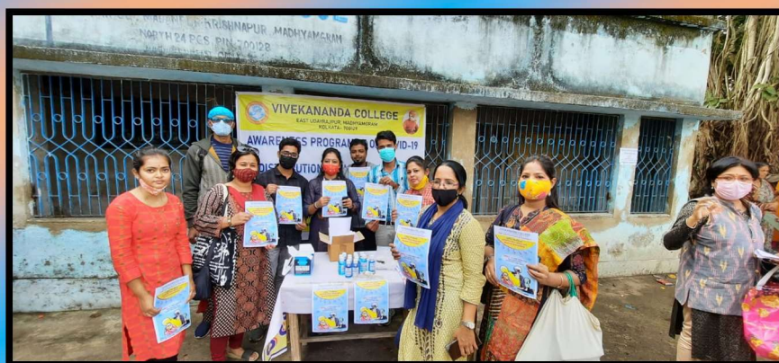
(Covid-19 Awareness programme to our adopted village under Unnat Bharat Abhiyan)