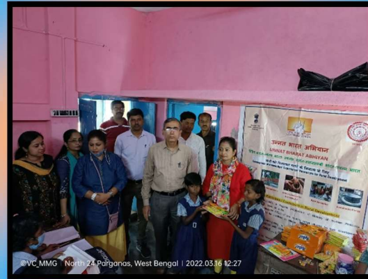
(Study material Distribution under UBA)