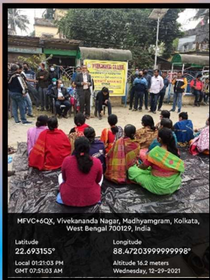
(Internet Banking Awareness Camp)