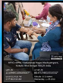
(Thalassaemia awareness & screening test)