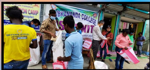
(Relief distribution to Sandesh Khali after Yaash)