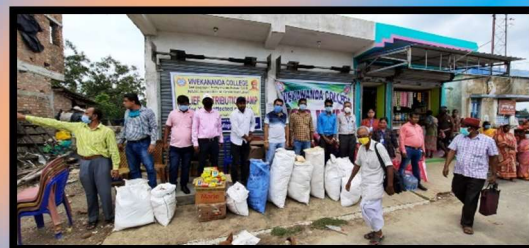
(Relief Distribution to Boalkhali after Amphan)