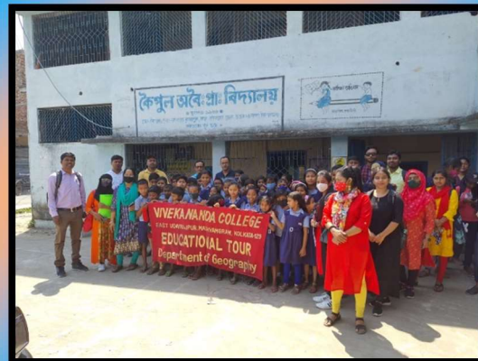
(Educational Tour Under UBA)