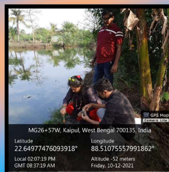
(Water & Soil testing at Kaipul)