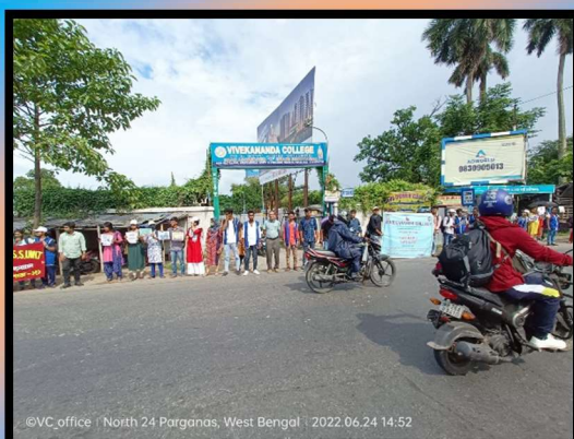
("Safe Drive Save Life" Awareness Rally)