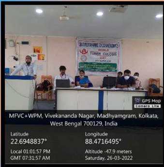
(Observed Tuberculosis Day)