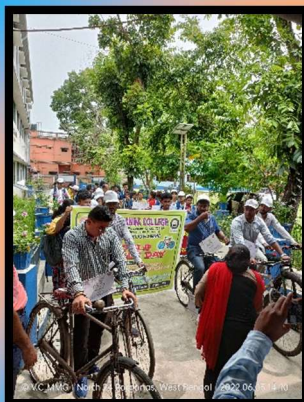
(Bicycle rally to celebrate World Bicycle day)