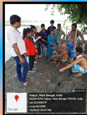
(Kaipul Village Survey)