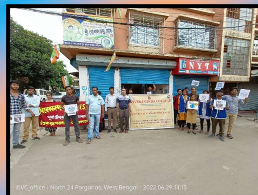
(Anti Plastic Rally)