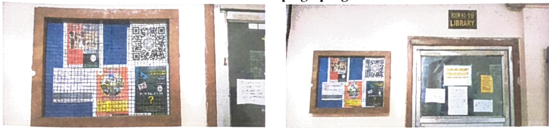
Library Display Board