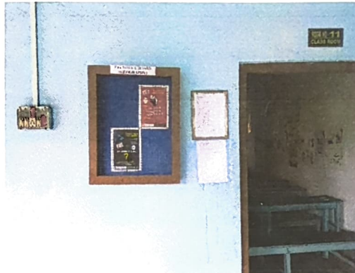
Department of Geography

Information regarding anti-ragging measures is also uploaded on the College website.